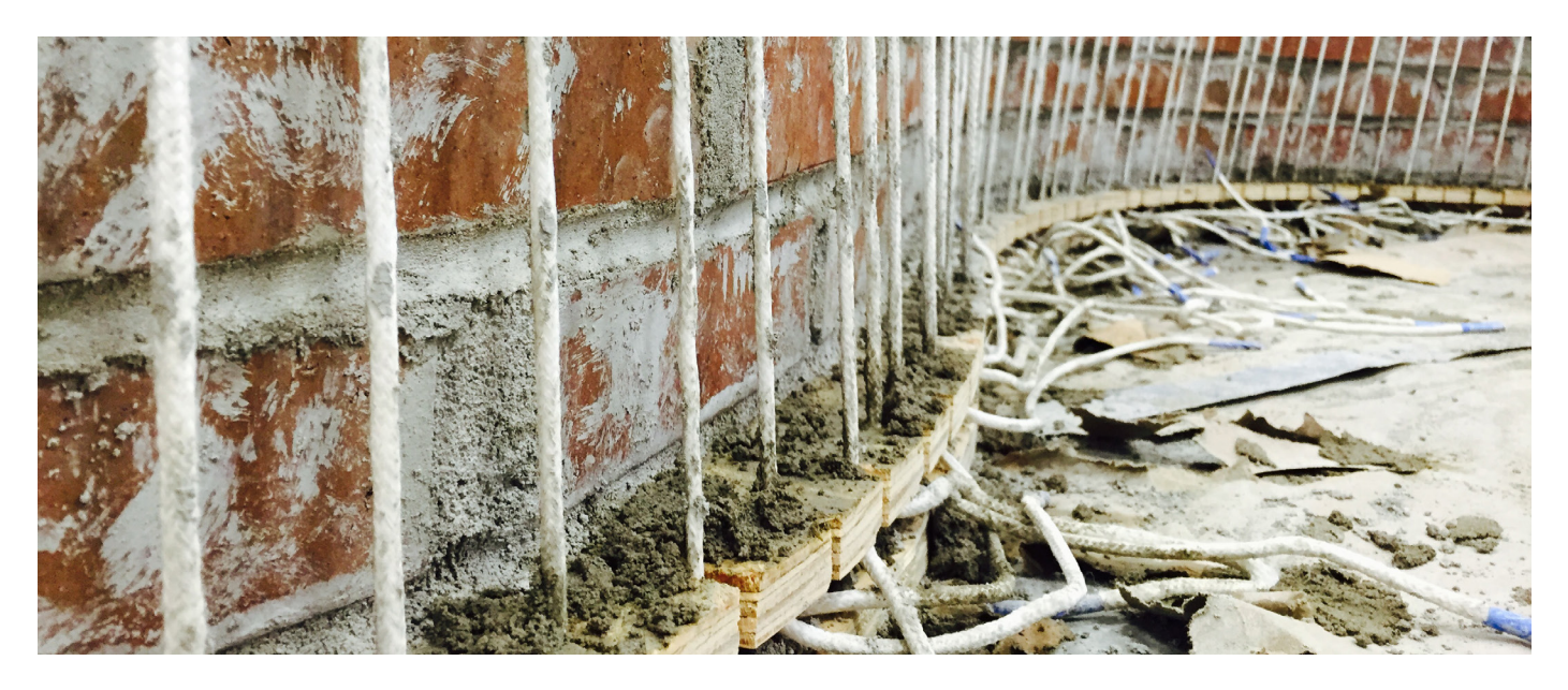
Figure 1: Bottom brick courses of Ruled Surface wall with string guides..

In the second half of the 20th century, the late Uruguayan engineer Eladio Dieste developed four structural innovations that emphasized the role of material error and challenged the dominance of graphical representation in architecture. The work presented in this paper considers "the proximate" as the assumption of an error-free architecture. The proximate is the precise execution of drawings and the obsession with infallible material production. In Dieste's work, the combination of double curvature geometries, like Ruled Surfaces, with steel reinforced masonry construction, expanded the modern pursuit of material control. The work discussed in this paper highlights the implications of building a Ruled Surface brick wall in an effort to disassociate precision from complexity. The resulting wall is a network of precise errors.