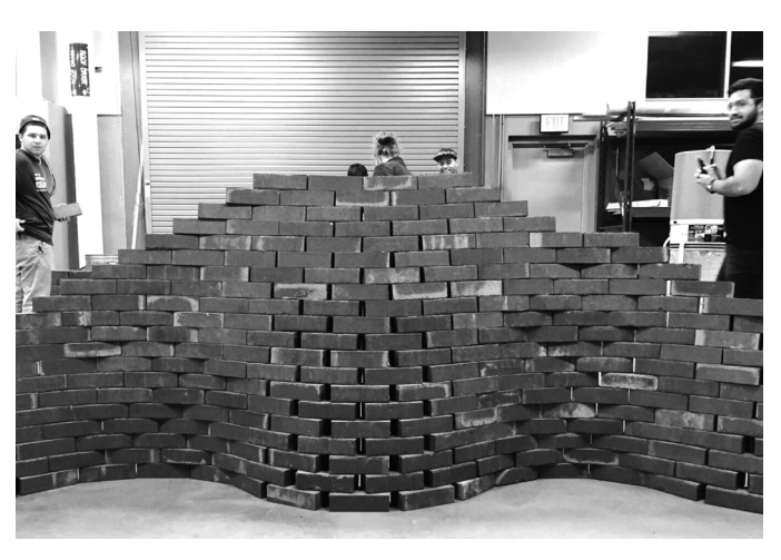
Figure 4: Improvisational Dry Stack Ruled Surface Brick Wall, 4'x12'x4"...

To build a brick and mortar Ruled Surface wall students designed a system of vertical string guides that established the geometry of the wall surface and limited improvisation; approximating matter into