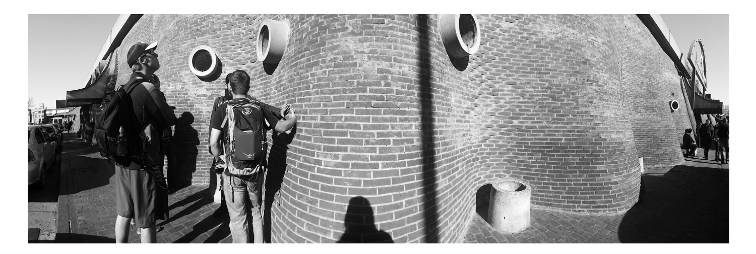
Figure 2: Montevideo Shopping Center Ruled Surface North Wall.